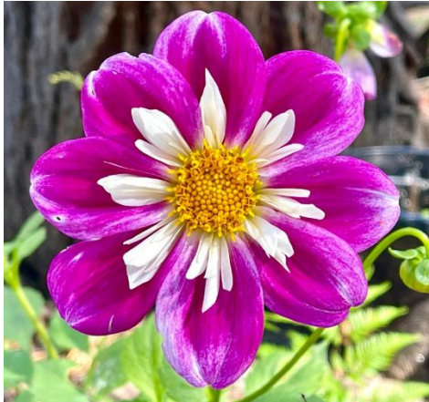
Aegean Sky - Collette