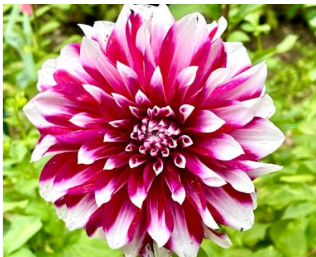
Helena - Medium Decorative